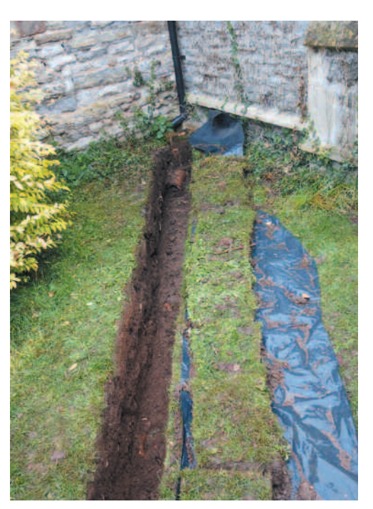
New rain water drains being created

The church was fortunate in obtaining a provisional offer of a grant from the Heritage Lottery Fund to assist in these repairs but this was dependent on the church obtaining £14,000 from other grants and fund raising activities.