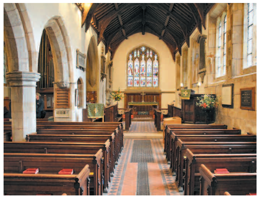
All Saints, Babworth

The present All Saints church at Babworth dates from the 15th and 16th centuries. It is principally built in the Perpendicular style with a chancel, nave, north aisle and low west tower. The church was restored in 1859-62