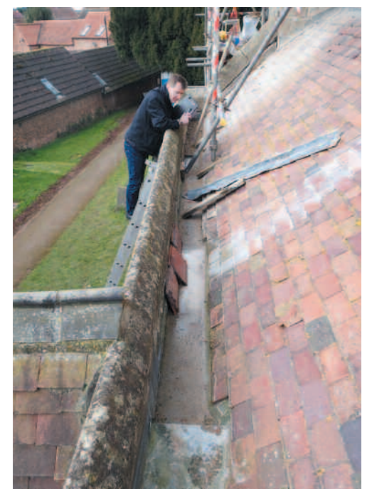
Lead flashing to the parapets was replaced

financial assistance provided by NHCT but for the expertise and assistance provided by the Trust's Grants Administrator in obtaining additional funding from other sources. We believe that the restoration project has revived the interest of the local community in the maintenance and well being of the church and there is now a greater desire to ensure the future sustainability of the building not only as a place of worship but also as a valuable community resource."