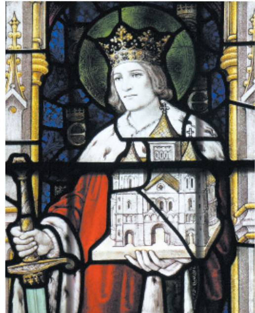
St. Edwin: depiction at St Mary, Sledmere, Yorkshire