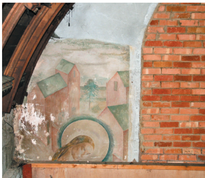
The Evelyn Gibbs murals before restoration

The church of St Martin of Tours stands on the site of an Anglo-Saxon settlement, and the main body of the church dates from mid-14th century. The small, rural village of Bilborough survived on its hill looking out over the growing expanse of the City of Nottingham until after the Second World War when it was swallowed up by the council house estates that now surround it. The single aisled, medieval church was inadequate for the growing population, and the church was extended in the 1970s by removing the north chancel wall and adding on a new 'worship space', with community rooms and facilities.