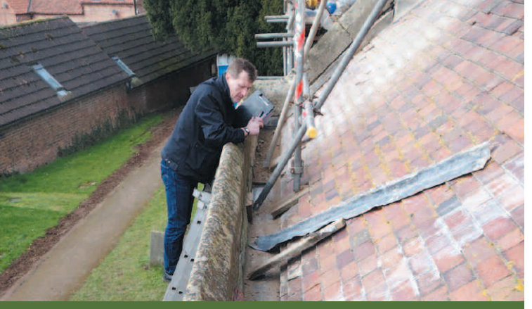
Lead replacement at St Helena's, Thoroton