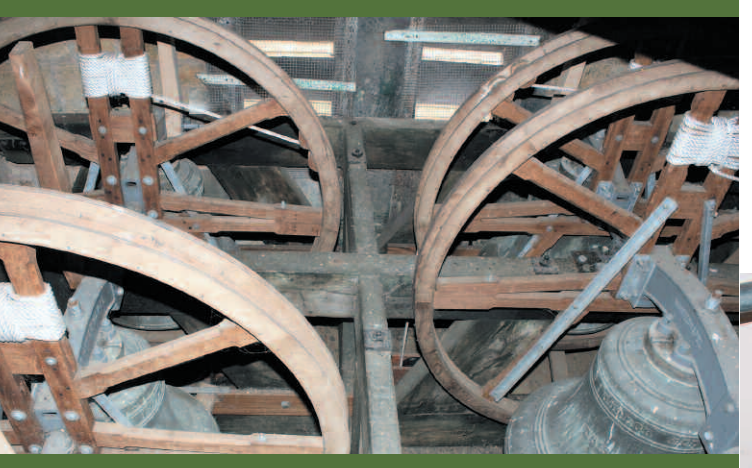
Re-hanging bells at All Saints', Harby