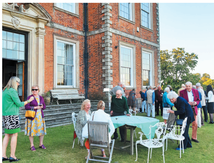
NHCT Summer Party 2021 at Winkburn Hall