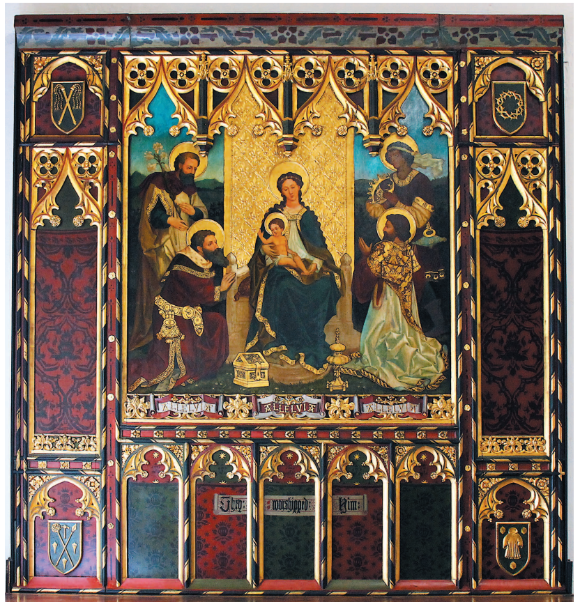
The Comper reredos, West Retford, after restoration

The reredos comprises panelled boards with the principal scene - the Adoration of the Magi - set centrally with four canopies, trefoiled and ogee-headed, above, and pierced quatrefoils set within the spandrels. Below the main scene are five openwork, trefoiled blind arches within which coloured, painted decoration and text have been placed. To the right and left of the main scene are two large canopied panels, gilded, with red, green, and black painted detail within. In each of the four corners of the reredos are further gilded, trefoiled canopies, within which are contained the painted and gilded symbols of the Passion. In the main scene, the background to the Blessed Virgin Mary comprises richly gilded cyma reversa decoration within which are contained fleur-de-lis. The whole is framed with barbers' pole decoration. The stencilled frieze at the top is an apparent later addition, probably when the reredos was moved to Retford; this is evident as the frieze has been cut in places to fit and was clearly from some earlier use.