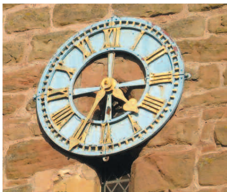
The clock face, St Swithin's, Wellow

Moving outside the church, the dial can be seen on the west face of the tower. In 1953 local craftsmen from the village constructed a new clock dial made from a mild steel sheet, painted blue, and fitted with gilt lead chapters and minute markings. Sometime in the 1980s the dial was repainted and regilded.